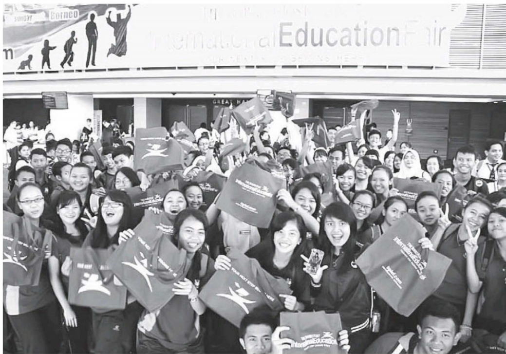
The eighth edition of the BPEF will be held next year at Vivacity Megamall from March 11-12, 10am to 7pm.