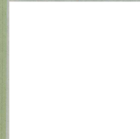
Parkroyal Kuala Lumpur guests will be celebrating Earth Hour with Happy Hour by complimentary at Klis Lounge where a one-for-one beverage offer will be extended for all house pours.