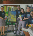
Art for the green: Holiday Inn Kuala Lumpur Glenmarie employees are all set to donation paintings, cakes and handicraft during the Earth Hour event.