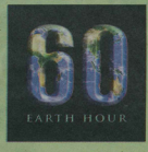
Lighting up: The Federal Hotel Kuala Lumpur will light up a globe with energy generated by pedalling a triathlon non-stop for an hour.

Hilton Kuala Lumpur will be offering guests with special dinner offers, including organic cuisine at Sensee, Barbecue at Beardwilde and Sushi Delights at Isteru. Holiday Villa Hotel & Suites Subang, named up its participation with one line, "We may be switching off the lights, but our hospitality does not stop."