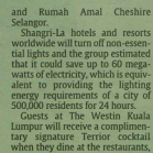
Shangri-La hotels and resorts worldwide will turn off non-essential lights and the group estimated that it could save up to 60 megawatts of electricity, which is equivalent to providing the lighting energy requirements of a city of 500,000 residents for 24 hours.