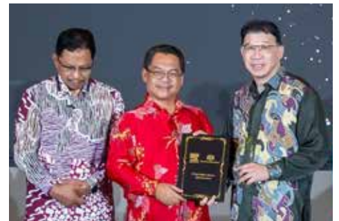
UCSI distinguished researcher clinches prestigious Science award for transformative impact