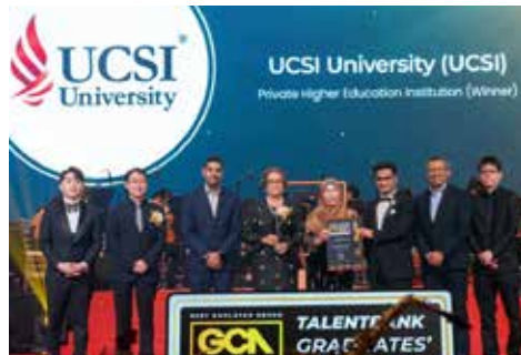
Graduates recognise UCSI University as a top employer in Malaysia