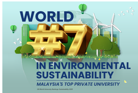
UCSI in world's top 10 for environmental sustainability