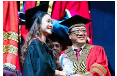
UCSI valedictorian embarks on AI-driven cancer research