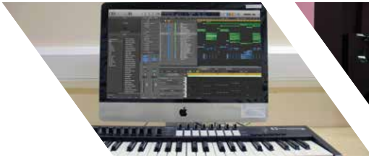
A music technology lab equipped with iMacs running Finale, Logic Pro X and Novation MIDI controllers