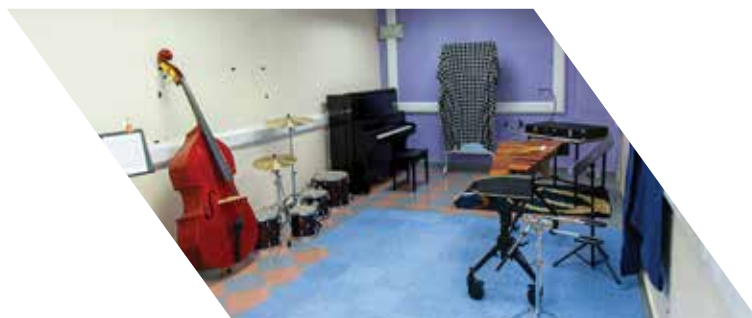
A Percussion Room for students specialising in percussion instruments and having one-on-one lessons