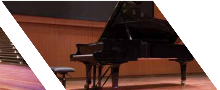
Two (2) concert grand pianos (Steinway-D and Fazioli F308)