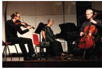
◀ The Orfeo Trio Grammy-nominated chamber music trio Artist-in-Residence

The Institute hosts an average of 40 events a year that encompass masterclasses and recitals by acclaimed musicians and seasoned academics who perform and adjudicate on the global stage. Some stay on as Artist-in-Residence for a period of time to enhance learning outcomes