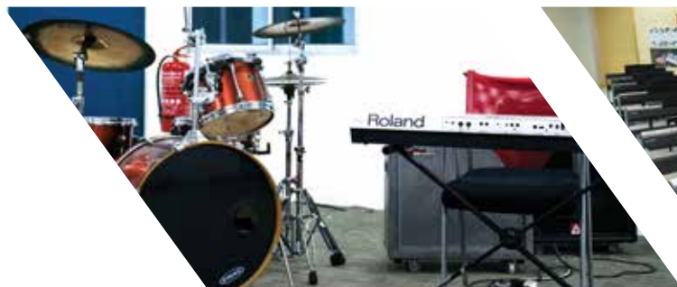
Drums/guitar/bass practice rooms