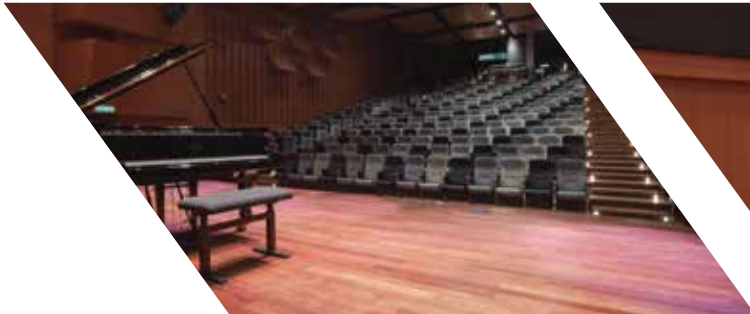
Recital Hall (400-seater) with recording facilities

The Institute of Music is built for aspiring musicians like you. And if you're going to realise your potential, you'll need the right learning environment to thrive in.