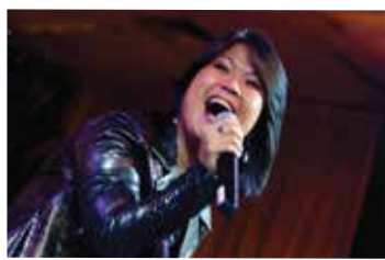
▶ Juwita Suwito Malaysian singer and industry luminary