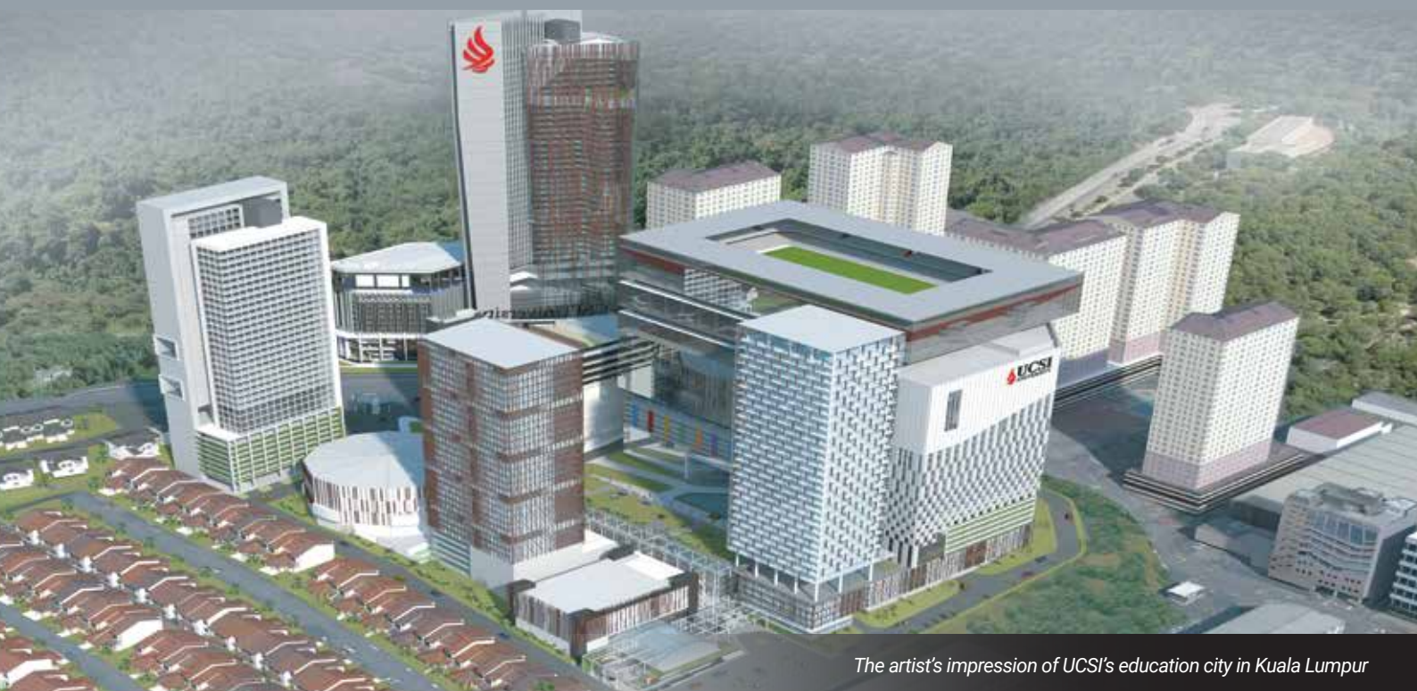
The artist's impression of UCSI's education city in Kuala Lumpur