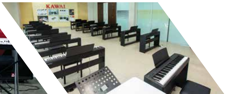
A Kawai Lab with electronic keyboards