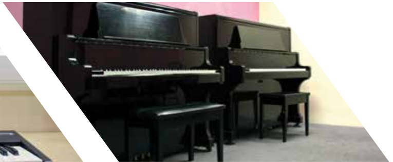
12 grand pianos (Boston, Kawai, Yamaha), 47 upright pianos