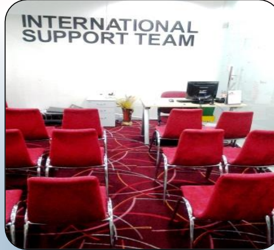
International Support Team (IST)

Counter Operation : Monday – Friday, 9.00am – 5.00pm Closed on Saturday, Sunday and Public Holidays