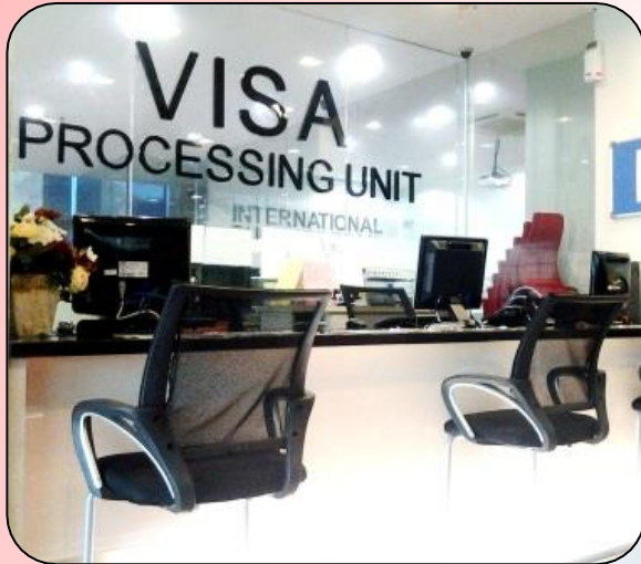
Visa Processing Unit (VPU)