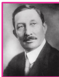
Caleb Bradham, Inventor of Pepsi

Pepsi was invented in 1893 in New Bern by a pharmacist named Caleb Bradham. The drink was known as 'Brad's Drink' & made from a mix of sugar, water, caramel, lemon oil, nutmeg, and other natural additives. It was later renamed as Pepsi-Cola in 1888.