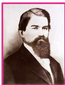
Dr. John Smith Pemberton, Inventor of Coca-Cola

The syrup of Coca-Cola was invented by a pharmacist named Dr. John Stith Pemberton in May 1886. It had initially been marketed as a medicine but later as a beverage after the addition of carbonated water. Pemberton arranged for it to be sold for five cents a glass!