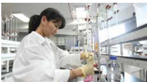
Applied Science Labs