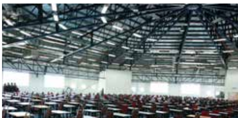
Dewan Tan Sri Ahmad Razali (DETSAR)