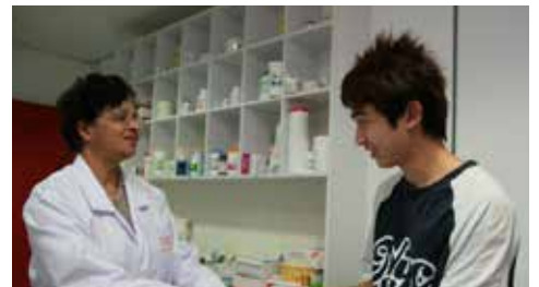
Laurent Bleu Clinic