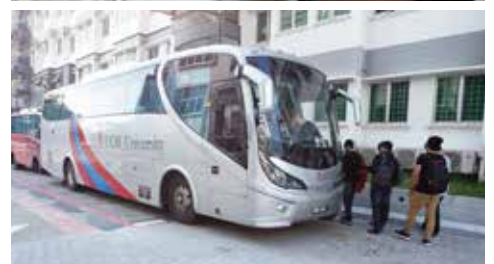
Free UCSI Shuttle Bus Services

For further information, please visit UCSI's website: ucsiuniversity.edu.my/smp/accommodation/