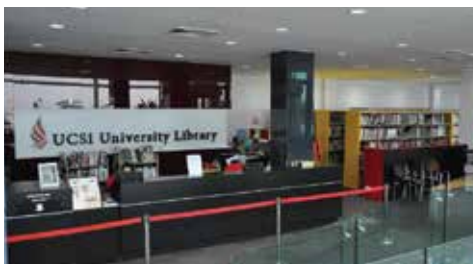
Library and Resource Centre

UCSI University also has Medicine labs, Social Sciences labs, Pharmacy labs, Hospitality facilities and Applied Science labs. All these facilities cater for the needs of the students according to their academic programmes and contribute to their learning experience.