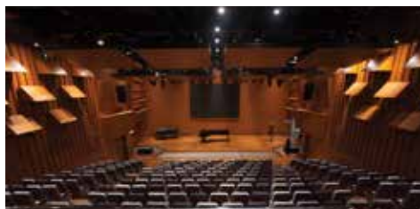
Recital Hall / Auditorium