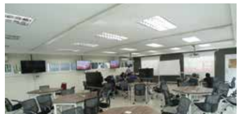
Active Learning Classrooms (ALCS)