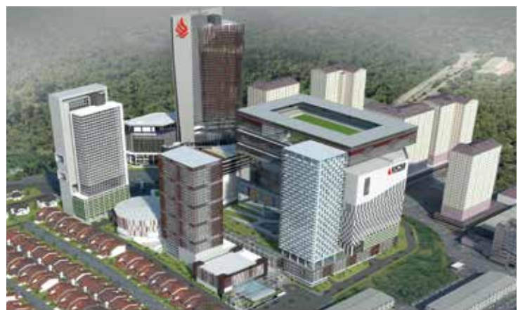
The artist's impression of UCSI's education city.

With these unique strengths and more, UCSI stands out as a University that offers an education few can, provides experiences others can't and delivers life-defining outcomes for students everywhere.