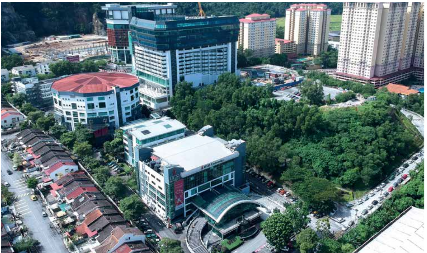
The isometric view of UCSI's Kuala Lumpur campus after its recent expansion.

This distinction opens doors for UCSI students and staff when it comes to collaboration with the world's best companies, research institutes and universities. Since 2014, UCSI's top students have been annually selected to advance high impact research at Harvard University, Imperial College London, the University of Chicago and Tsinghua University, among others. A batch of Pharmacy students also furthered research at the University of British Columbia and more endeavours are in the pipeline with leading universities in the Ivy League, the Russell Group, Universitas 21 and Australia's Group of Eight.