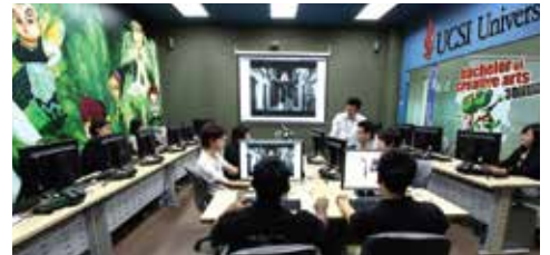
Creative Arts and Design Facilities